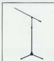
Performer Series Tripods and Booms