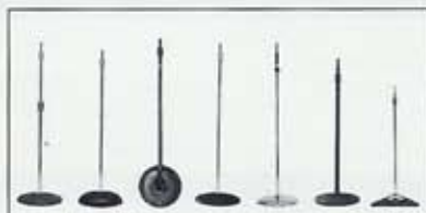
Floor Stands with Cast Iron Bases