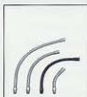
Goosenecks & Accessories