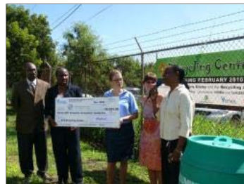
Boys and Girls Club representatives receive check from WMA officials during presentation ceremony Monday.

The Boys and Girls Clubs of the Virgin Islands' St. Croix recycling center in Anna's Hope will be reopening soon and taking aluminum and steel cans, thanks to a grant from the V.I. Waste Management Authority (WMA).